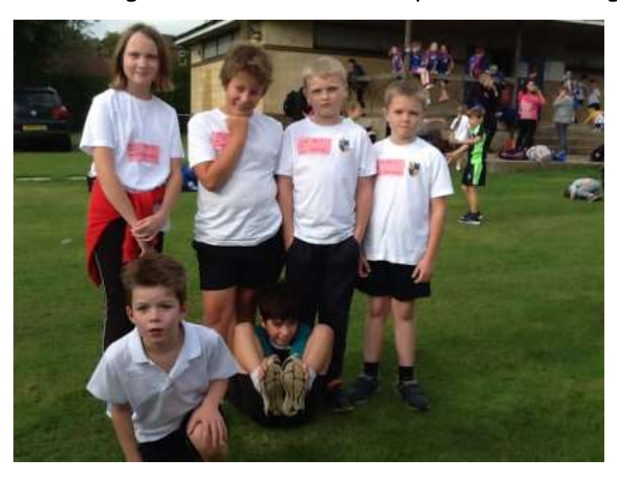
A year 5 /6 team took part in the small schools football tournament.

These began with a cross-country event for all age groups.