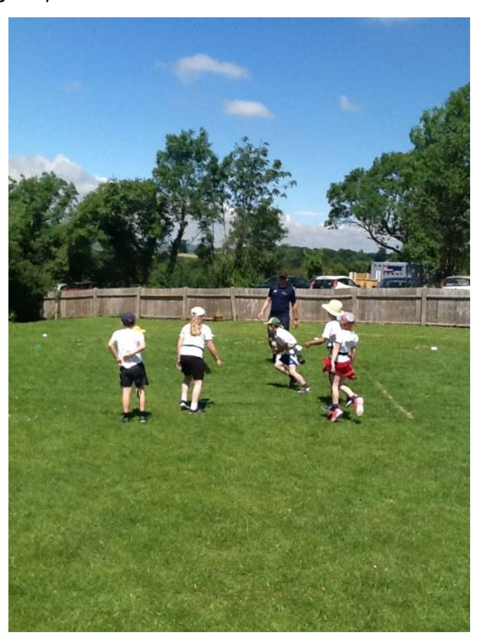
Tag Ruby match

During the Summer term, the Sports Crew have organised another two tournaments within school: tag rugby and football All of the Junior children and year 2 took part.