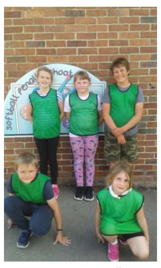
Green Football team

The final SSP event attended for this year was a rounders tournament.